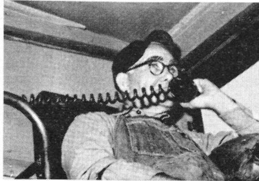
Freight conductor talks to engineer, another train or wayside station.