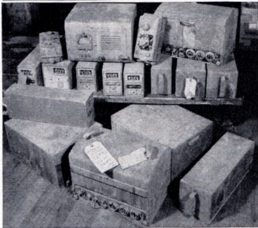
Muck-laden Motorola units as they came from flooded engines and cabooses.